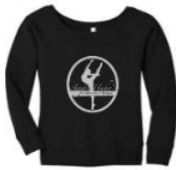
■ BELLA+CANVAS Women's Sponge Fleece Wide-Neck Sweatshirt (Liquid Silver Ink) Bella+Canvas | BC7501_16648796 $36.00

https://stores.identitysource.com/angiehahn/