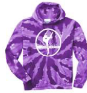
■ Port & Company Essential Tie-Dye Pullover Hooded Sweatshirt Port & Company | PC146_16648796 $45.00