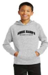
■ Sport-Tek Youth PosiCharge Electric Heather Fleece Hooded Pullover Sport-Tek | YST225_16648797_1 $45.00