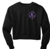
■ District Womens Perfect Weight Fleece Cropped Crew District | DT1105_16648794 $35.00