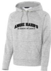
■ Sport-Tek PosiCharge Electric Heather Fleece Hooded Pullover Sport-Tek | ST225_16648797 $45.00