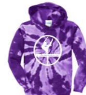
■ Port & Company Youth Essential Tie-Dye Pullover Hooded Sweatshirt Port & Company | PC146Y_16648796 $45.00