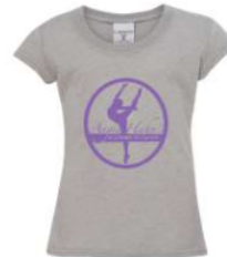
■ Youth Glitter T-Shirt J. America | 83028_16648794 $25.00