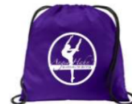
■ Port Authority Ultra-Core Cinch Pack Port Authority | BG615_16648796 $10.00